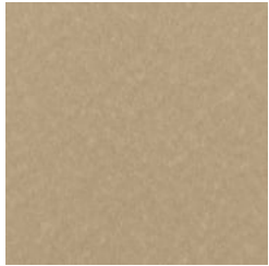
ECRU - PET