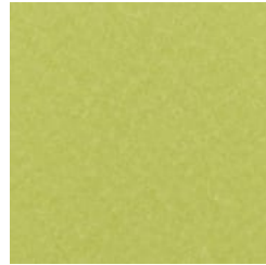
GRASS - PET