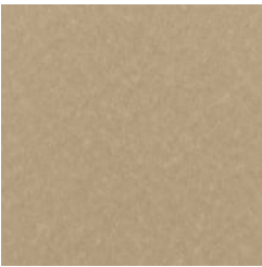
ECRU - PET