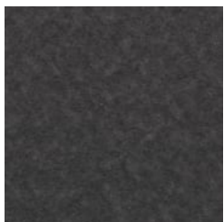
SLATE - PET