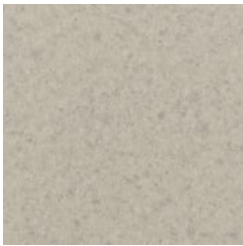
GREIGE - PET