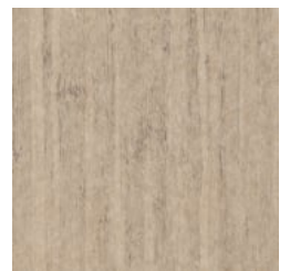
EUCALYPTUS - TIMBER PET