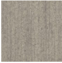
IRONBARK - TIMBER PET