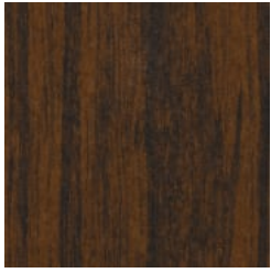
MERBAU - TIMBER PET