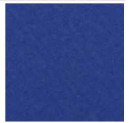
COBALT - PET