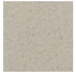
GREIGE - PET