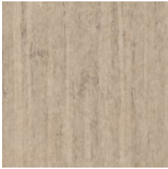
EUCALYPTUS - TIMBER PET