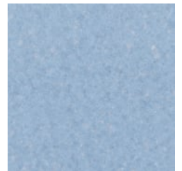
SKY - PET