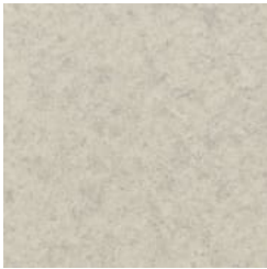
PEBBLE - PET