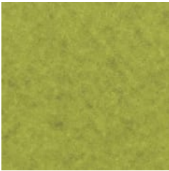
OLIVE - PET