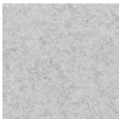
SMOKE - PET