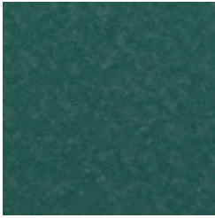
MALACHITE - PET