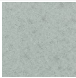
CADET - PET