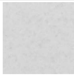
CHAMBRAY - PET