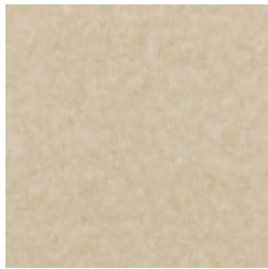
LINEN - PET