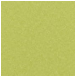
GRASS - PET