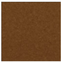
BARK - PET