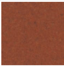
BRICK - PET