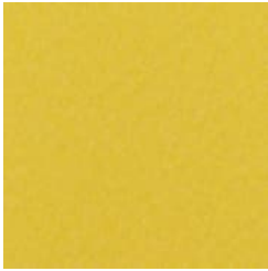
SUNSHINE - PET