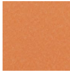
MANDARIN - PET