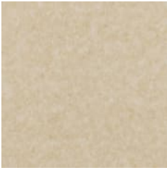
LINEN - PET