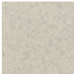
PEBBLE - PET