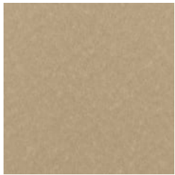
ECRU - PET